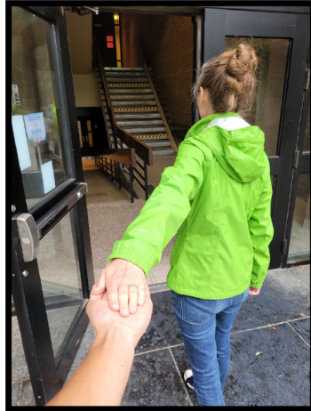
MATHE M ATICS & COMPUTING