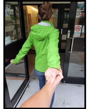
C HEMISTRY 2