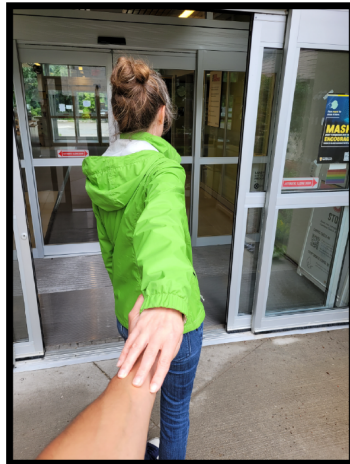
HEALTH H SERVICES