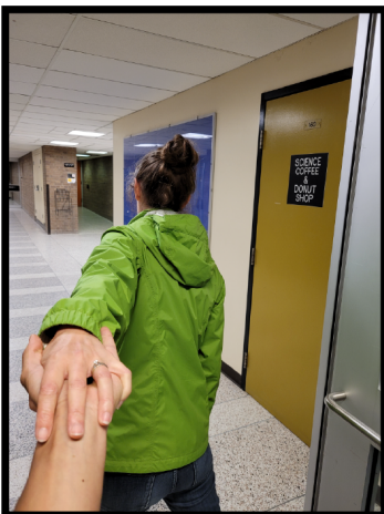
B IOLGY 1