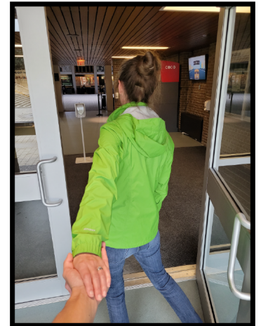
STUDENT LIFE C ENTRE