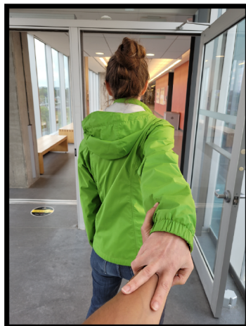
E NGINEERING 5