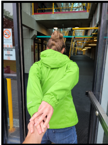
DAVIS C ENTRE