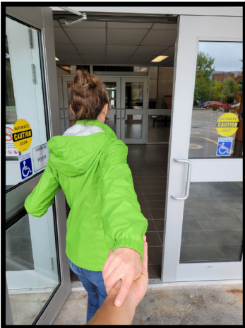
A RTS LECTURE HALL