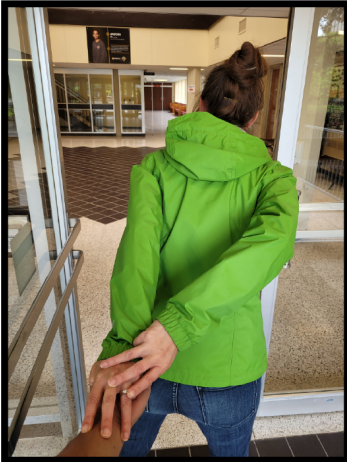
MODERN N LANGUAGES

The inspiration for this puzzle is #FollowMeTo photos, which are photos of people being led to various beautiful places. We thought places on campus would be fun, but in reality, managing the doors, avoiding people, and ensuring the correct number of fingers was clear in each photo was little challenging!